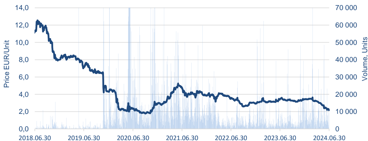
Volume and price of AB Novaturas shares in Nasdaq Vilnius Stock Exchange

As of 30 th June 2024, the company's market capitalization was EUR 17.02 million and decreased by 32% during the second quarter.